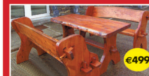
Table & Seat Set