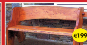
3 Seater Bench