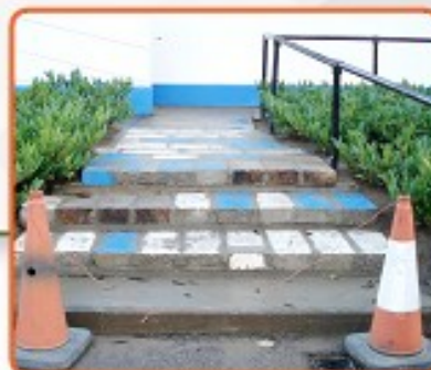
COMPLETION OF STEPS at Killarney Athletic