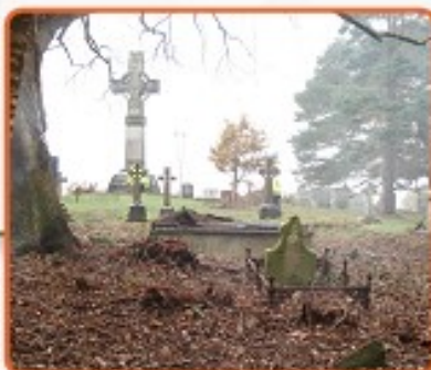
CLEARING OVERGROWTH at Killeegy Burial Ground